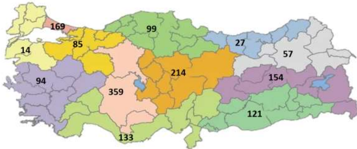
Figure 1: Number of New COVID-19 Cases by NUTS-1, Turkey